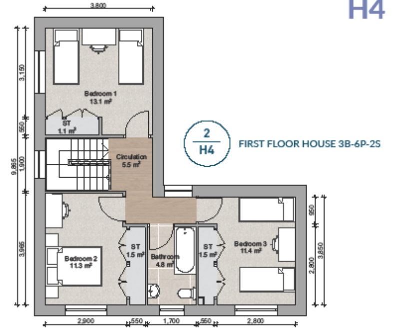
2 H4 FIRST FLOOR HOUSE 3B-6P-25