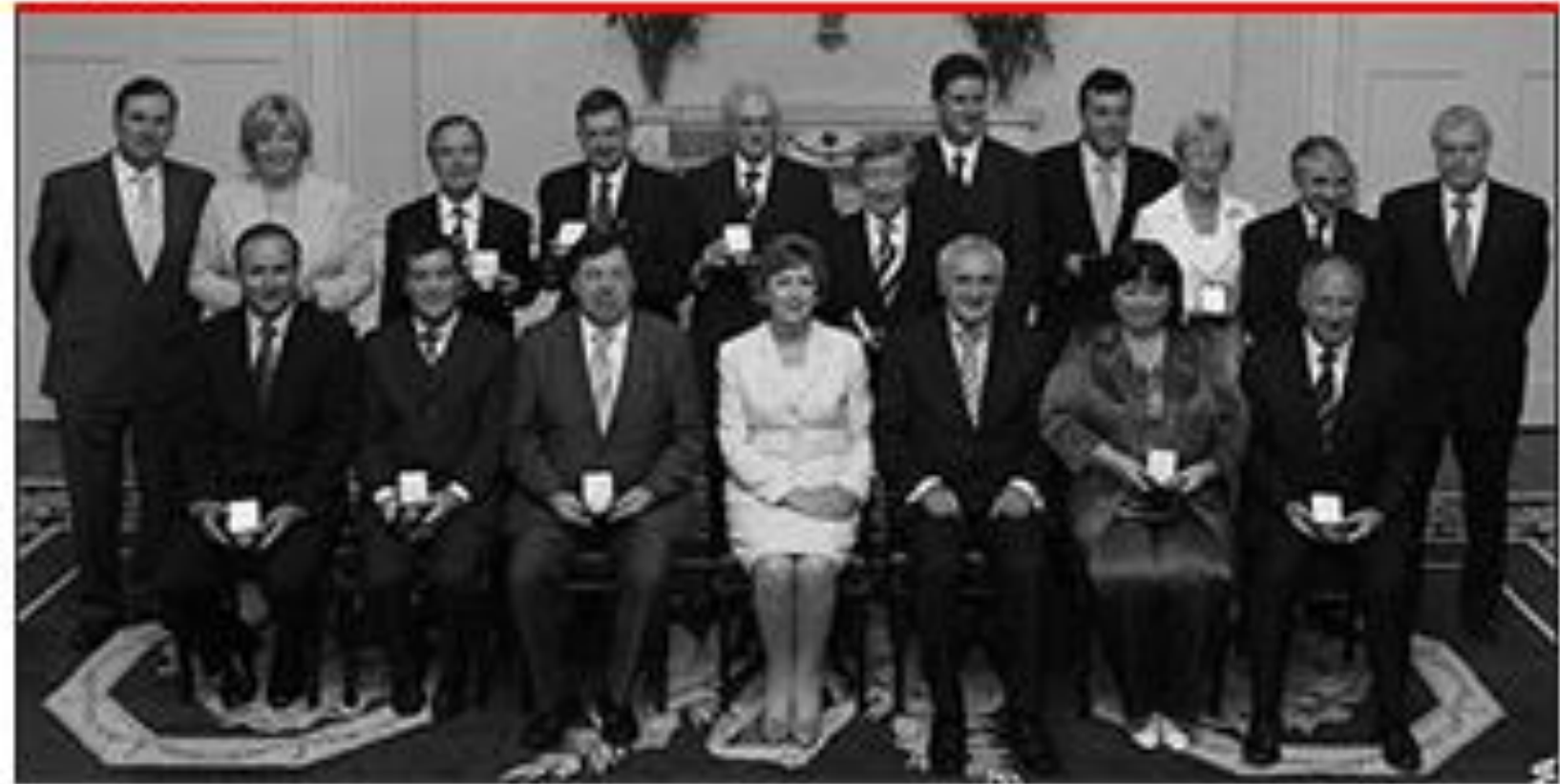
Fianna Fáil, Green Party and Progressive Democrats