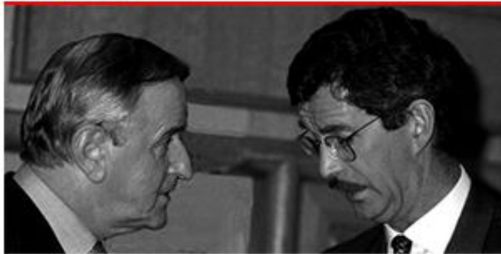
Fianna Fáil and Labour