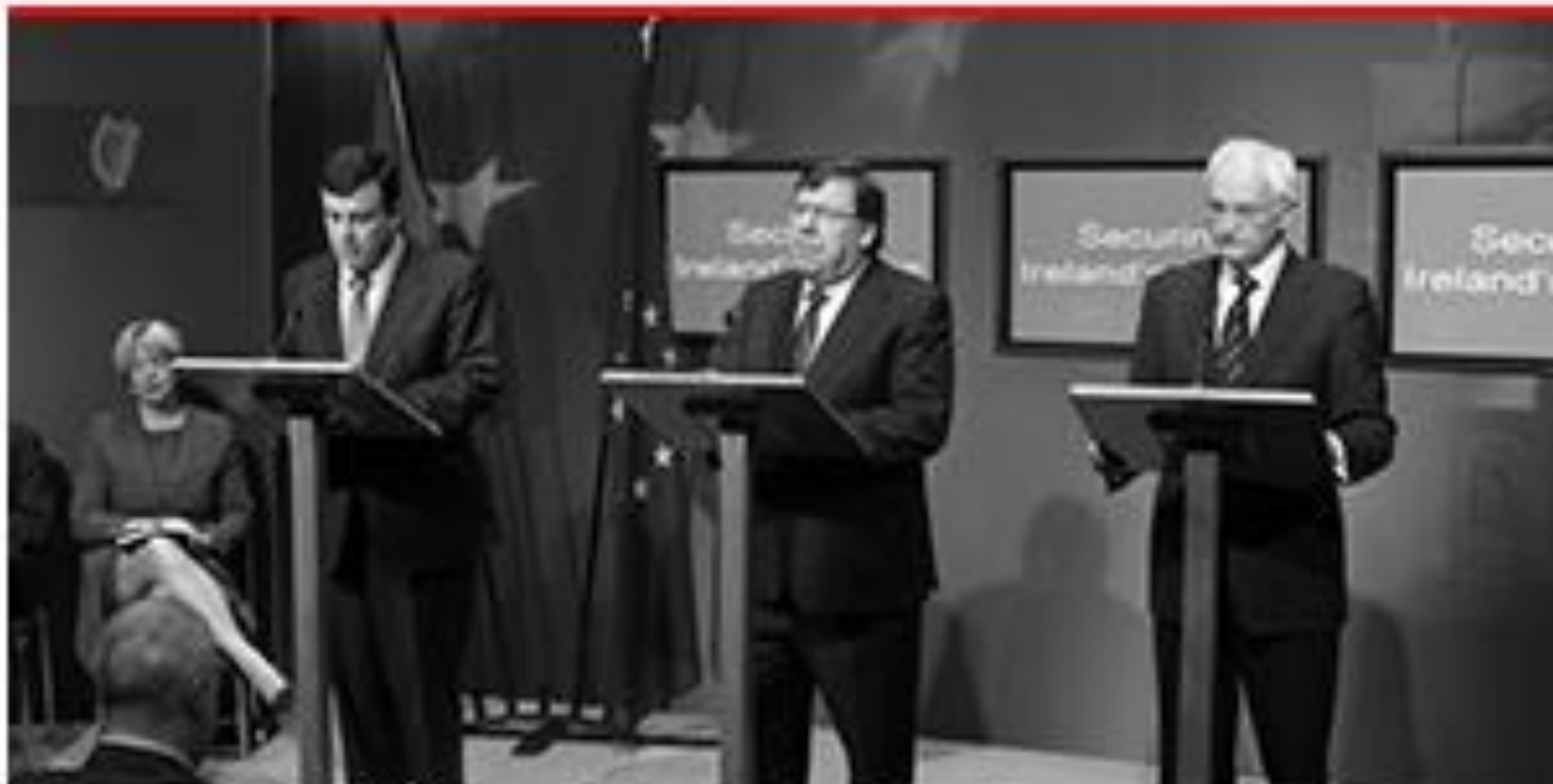
Fianna Fáil and Green Party 1993-1994