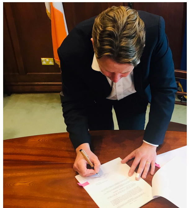
Minister O'Brien signing order under Part 5, Section 29 of the Civil Law Act 2020.

However, AILG would like to stress to our members that regardless of the order signed by the Minister, it is a matter for the Elected Members of each Local Authority to decide if they wish to avail of the additional option of being able to hold remote statutory meetings. Therefore, it is entirely the prerogative of the Elected Members of each individual local authority, to decide by resolution of the elected council, if they wish to amend their own standing orders to provide for the option of remote statutory meetings.