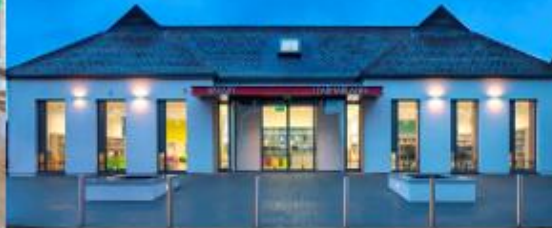
Portarlington Library Laois