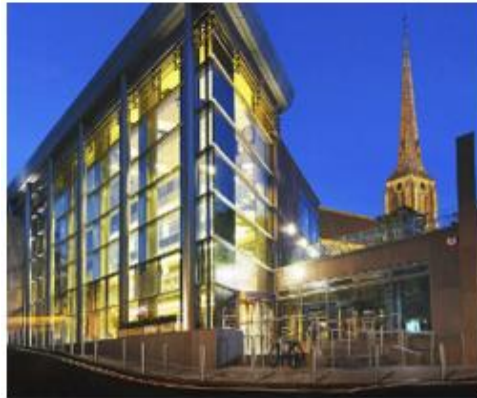
Wexford Town Library