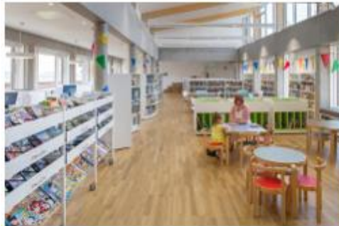
Hollyhill Library Cork