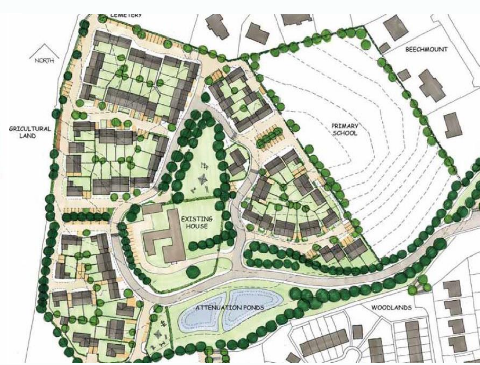
Images from Cork Residential design guide 2011